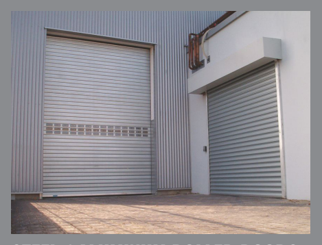
STEEL / ALUMINUM ROLLER DOORS