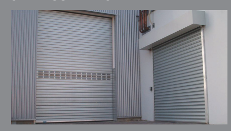
STEEL / ALUMINIUM ROLLER DOORS