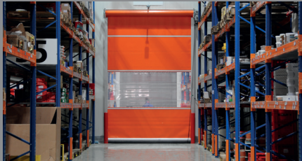
VERTIKAL HIGH-SPEED DOORS