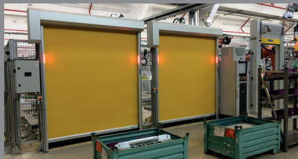
MACHINE PROTECTION DOORS