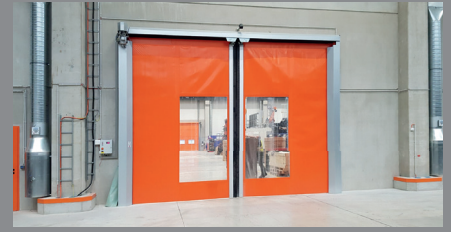
HORIZONTAL HIGH-SPEED DOORS