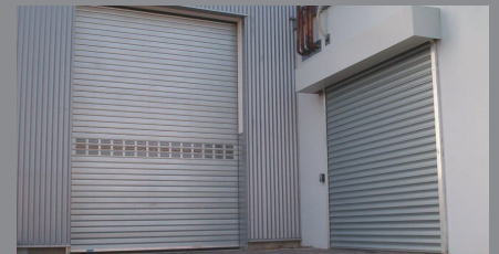
STEEL / ALUMINUM ROLLER DOORS